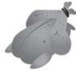
1 fish .....