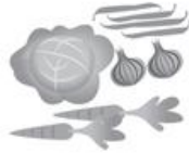
eggs vegetables .....